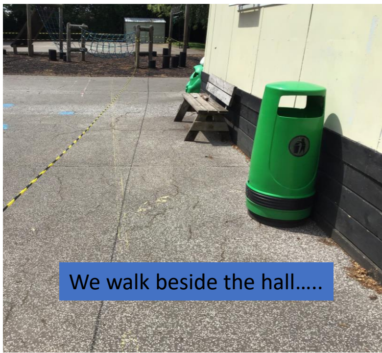
We walk beside the hall.....