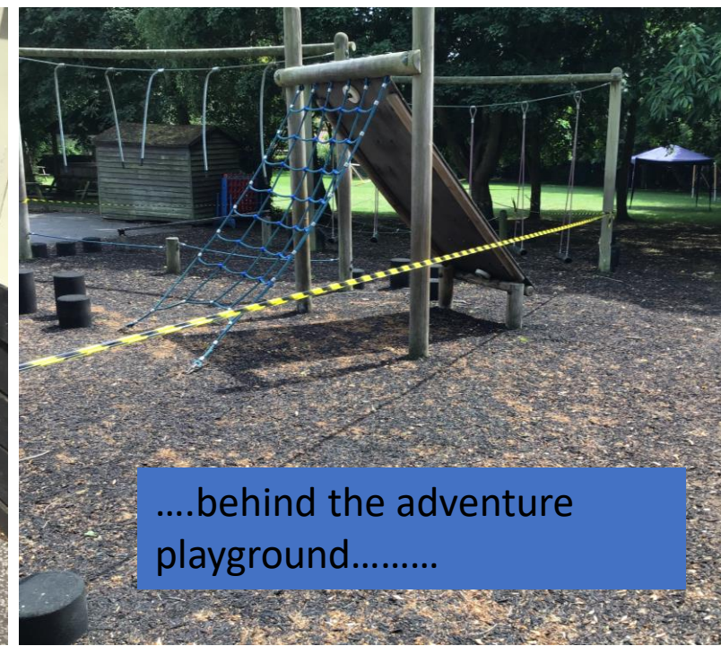
....behind the adventure playground.....