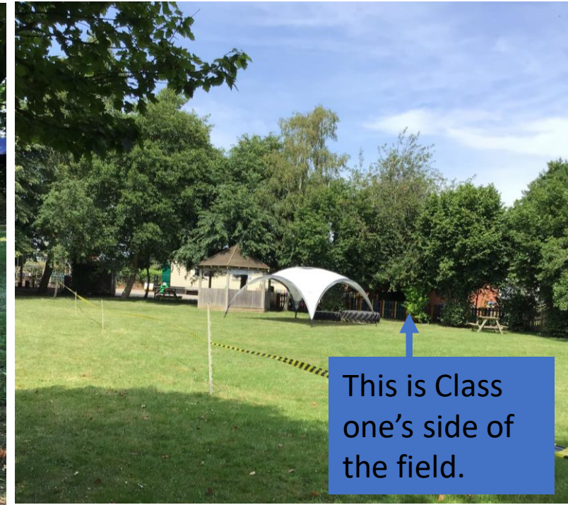
This is Class one's side of the field.