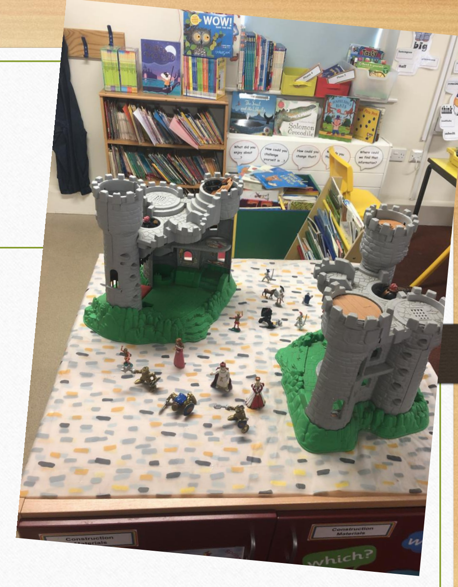
Small world area and book corner