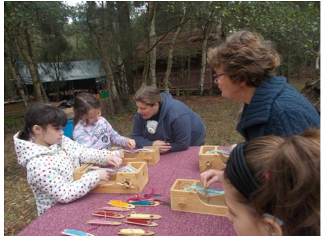
Weaving on a loom to make our very own bracelets.