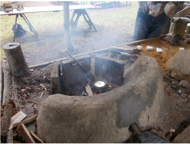
Melting pewter to our into our face moulds