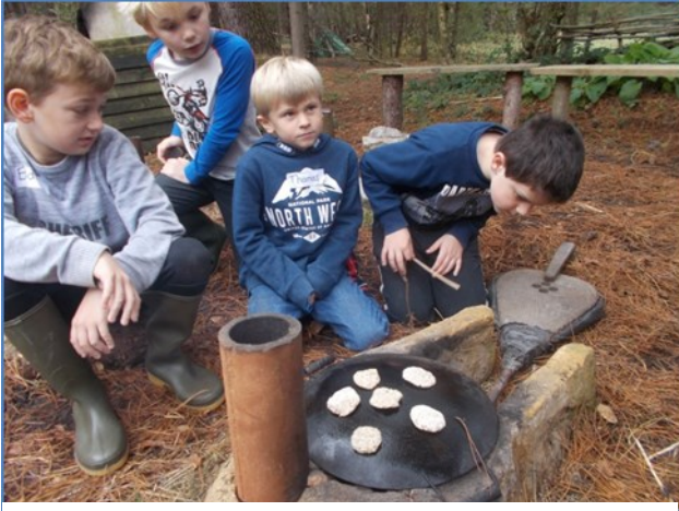
Making and cooking flatbreads from grinding our own flour.

As part of our Roman topic this term, Class 2 visited Hands on Heritage, an activity centre based in Tunstall Forest near Snape. In small groups, we took part in several workshops including weaving sheep's wool on looms to create Roman bracelets, making and cooking flat breads on an open fire and smelting pewter to make our very own Roman amulets. The highlight was being real life archaeologists when we helped excavate a Roman villa. We cleared away loose sand and earth to reveal all sorts of Roman artefacts ranging from pieces of pottery, oyster shells, animal bones and roof tiles. The most exciting find was the mosaic floor and the painted fresco on the wall of the bath house. Here are some photos of the day.