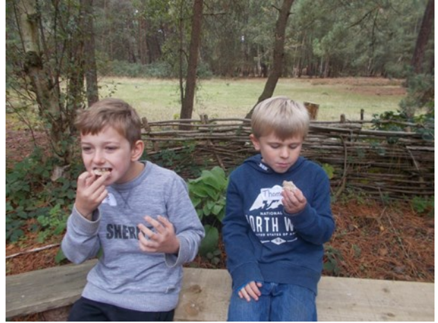
Eating our flat breads spread with a little honey.