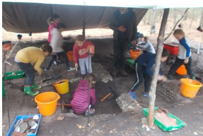
Excavating a Roman villa and finding many interesting Roman artefacts.