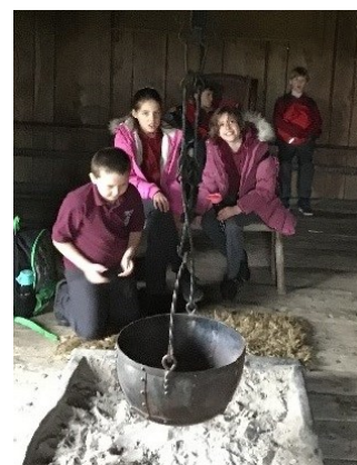
The Anglo-Saxon hall where people would gather to discuss matters of the day and to listen to stories whilst eating their evening meal.