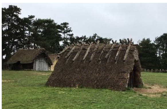
A typical Anglo-Saxon house made from timber, thatch and wattle and daub.