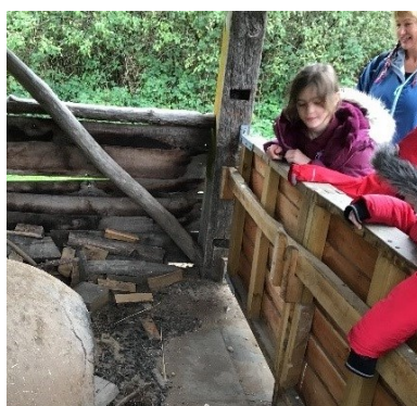
The Anglo-Saxon bread oven.