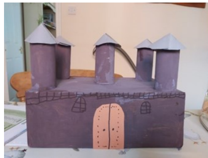
Phoebe's Book in a Box - Can you guess the title?